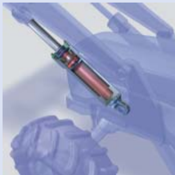
Merkel hydraulic sealing system