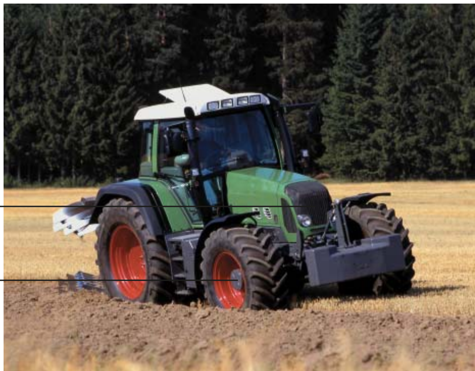
Simmerring® Cassette Seal Simmerring® Combi Seal