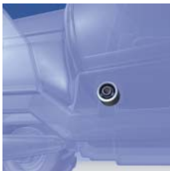
Hydro mount Hydro bush