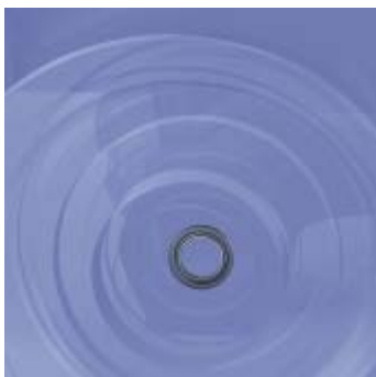
Simmerring® Premium Pressure Seal (PPS)