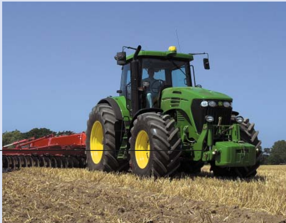
Integral Accumulator Hydropneumatic front axle suspension