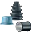
Special Sealing Products